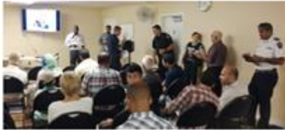
Information session with Masjid Al-Iman community members

The Greater Victoria Police Diversity Advisory Committee (GVPDAC) is based in Victoria, B.C. and connects, builds relationships with, and fosters communication and understanding between diverse communities and the region's five police agencies. The Sidney and West Shore RCMP detachments are represented on the Committee, which participates in various activities including informational and educational events, community engagement initiatives, and outreach events across the Island.