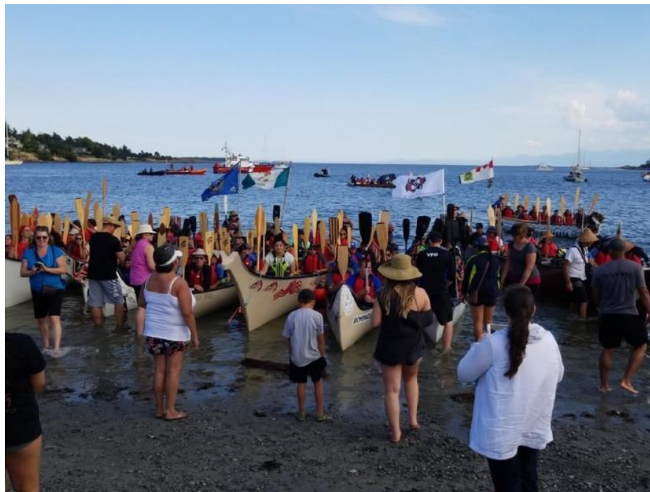
Local police officers took part in the Pulling Together canoe paddling journey in 2018.