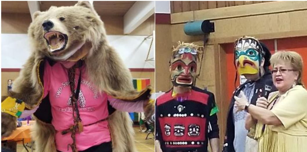
Two Spirit Gathering at VNFC (Victoria Native Friendship Centre) in November of 2018

There are many additional police-community diversity initiatives every year that help to build trust and strengthen relationships between members of Greater Victoria police forces and people from diverse community groups. Here are just a few examples of these activities: