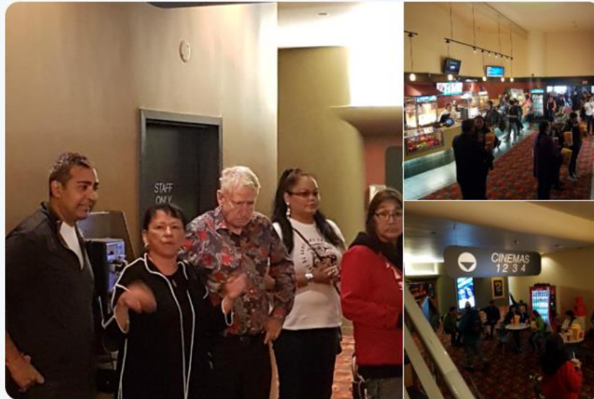
Relationship-building over movies with Victoria Police and Aboriginal street community