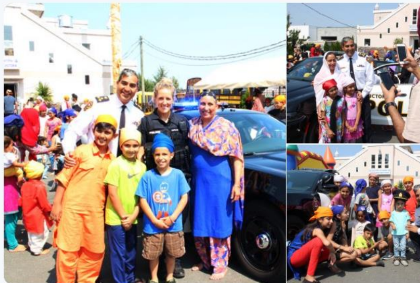
GVPDAC police agency members participate in numerous events on their own initiative