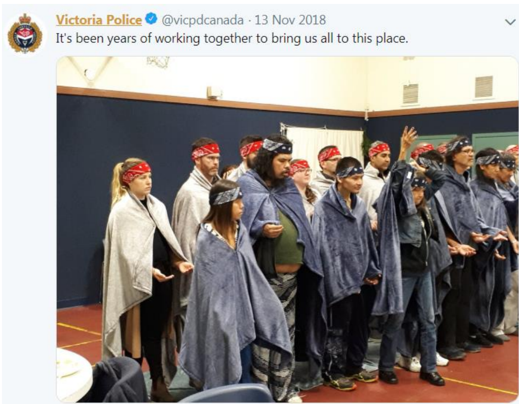
Brushing off ceremony for Victoria Police employees to represent the forging of their new relationship with the Aboriginal Coalition to End Homelessness