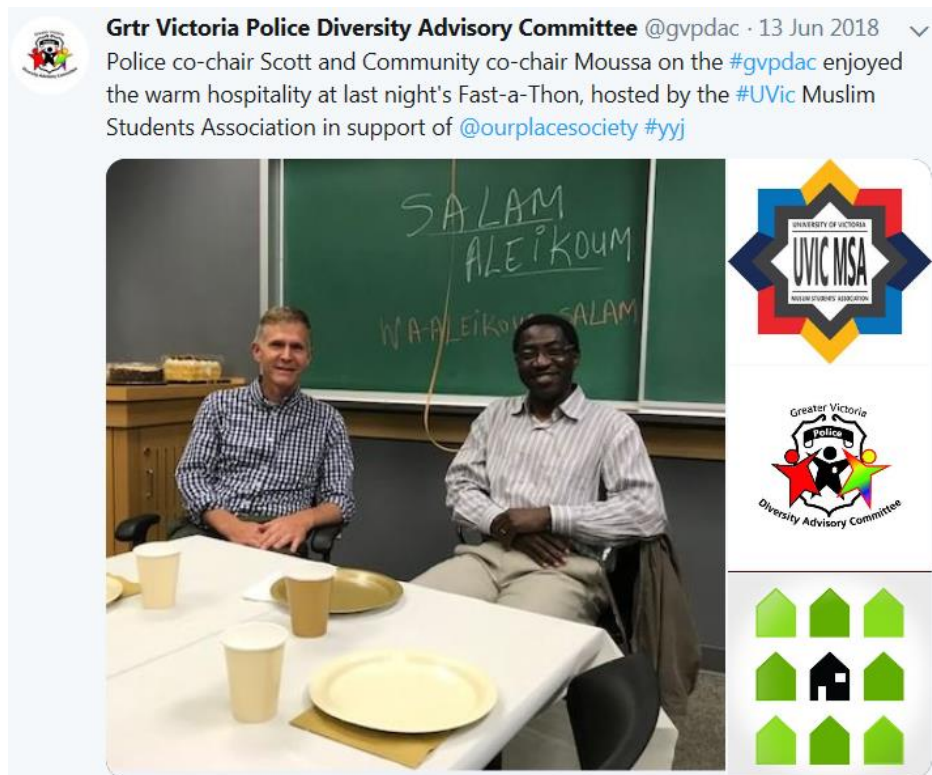
GVPDAC members were invited to Fast-a-Thon by the UVic Muslim Students Association